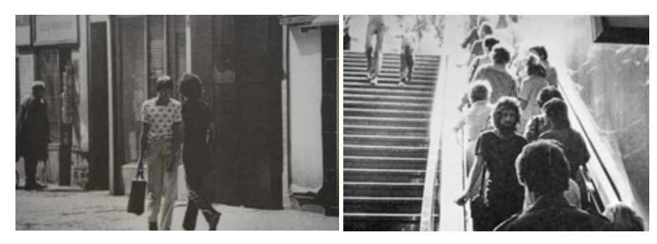
Figure 6. Two actions by Kovanda. On the left, Contact , September 3 1977. On the right, Untitled , September 3 1977. Copyright by Jiří Kovanda. Used by permission.

SVAŠEK: I look through the lens, take a few shots ... But then, the magical moment doesn't arrive. What is it? I'm not sure. Something is wrong ... In the original performance, was he not standing with his body turned in the other direction?