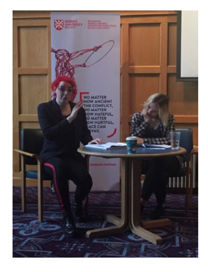
Figure 2. The actors looking at Kovanda's catalogue.

carpet, a banner advertising the university, and a projection screen too small to serve as a proper backdrop. The projections intended to evoke the Prague setting and Kovanda's presence, but they were hardly visible to have the intended visual impact (Figures 1, 3). While a proper theatre would have been the ideal performance space, the conference theme of "Creativity, Resistance, and Hope: Towards an Anthropology of Peace", 11 contextualized the play very well. Post-performance comments and questions from the audience revealed that we had managed to communicate the main gist of the play. The experiment demonstrated that the theatre format was an appropriate genre for posing anthropologically relevant questions, presenting ethnographic findings and investigating practices of fieldwork.