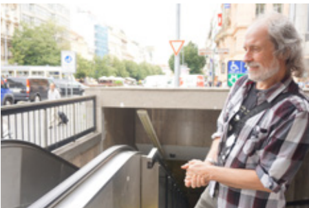
Figure 8. Kovanda on and by the escalator in 1977 and 2017 respectively. Photograph on the left, 1977. Copyright Jiří Kovanda. Used by permission. Photograph on the right by Maruška Svašek, 2017.