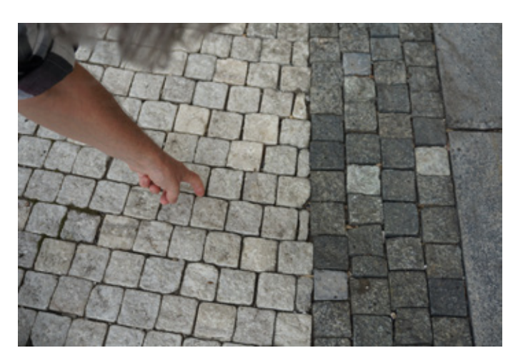
Figure 10. Kovanda points at a spot where the installation happened.