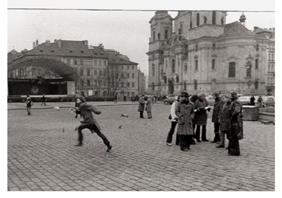
Figure 9. Action at Old Town Square, January 23 1978. The text says, "I had a meet-up with several of my friends... We were standing in the square talking... Suddenly, I started to run... I was running over the square and got lost in one of the streets..."