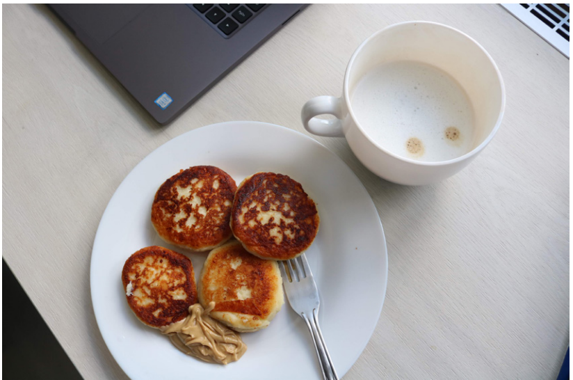
Figure 18. Day eight, first day after the quarantine: Breakfast syrniki ("cottage cheese pancakes") that Alina's father cooked for her.