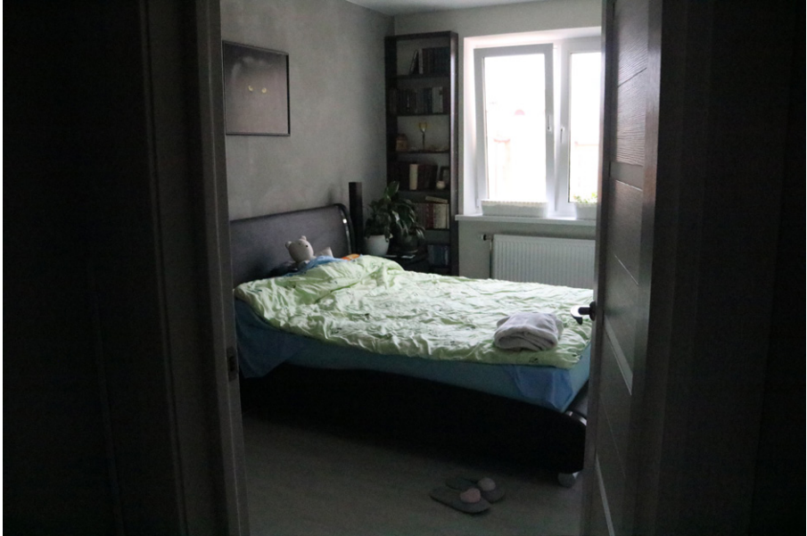
Figure 7. Day four: Empty parents' room.

I was looking into the empty room trying to imagine what would happen if my mum never came back home. In everyday life, all these warm feelings can be easily forgotten, especially with family conflicts drawing all of the attention to them. One begins to appreciate what they have only when the situation is na grani ["on the verge of something terrible happening"]. When I took this picture, I was feeling a lot of things that were unsaid between me and my mother, and I remembered all the feelings that I wasn't used to sharing and all the things that I wasn't used to feeling every day. Events like this open up your eyes and allow you to take a look inside yourself.