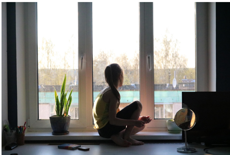
Figure 1. One day before the beginning of the project, and the first week of the family's unofficial isolation: Asya is looking out of the window, watching other kids playing outside.

and photography skills allowed Alina to have more creative freedom in how she wanted to portray her family life and articulate her feelings through images. Thus, the visual elements in most of the collected photographs were not accidental but well thought-out intentions of the photographer, which added a layer of meaning to the photographs' analysis.