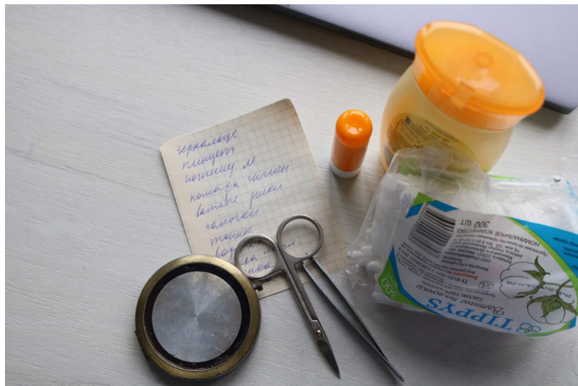
Figure 12. Day six: Items that Alina’s mother requested to bring to her to the hospital.