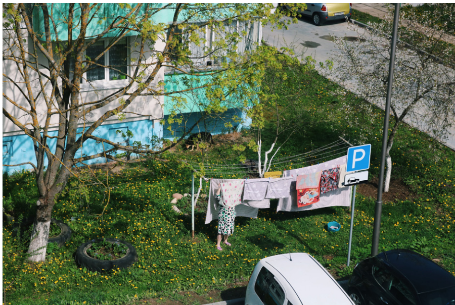
Figure 16. Day eight, first day after the quarantine: Alina's neighbours outside on the street.

[Figure 1] where Asya is looking out the window with some sort of sorrow. You can still see the monotony of those days, but at the same time this monotony has stopped causing this sense of protest inside of me; it stopped “strangling” me. [...] My room is my new world now.