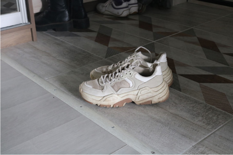
Figure 10. Day six: Alina's favourite sneakers that she did not get to wear during the quarantine.