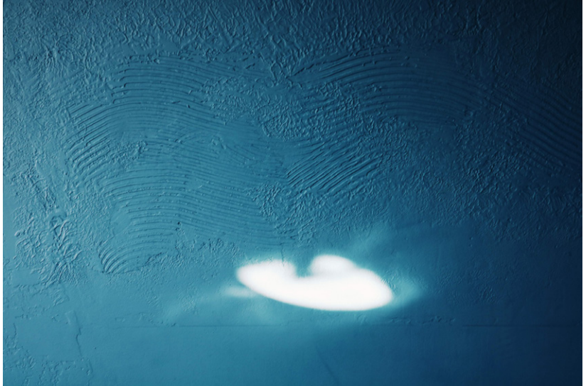
Figure 17. Day seven: Photograph of the wall in Alina's room with a ray of sunlight on it.