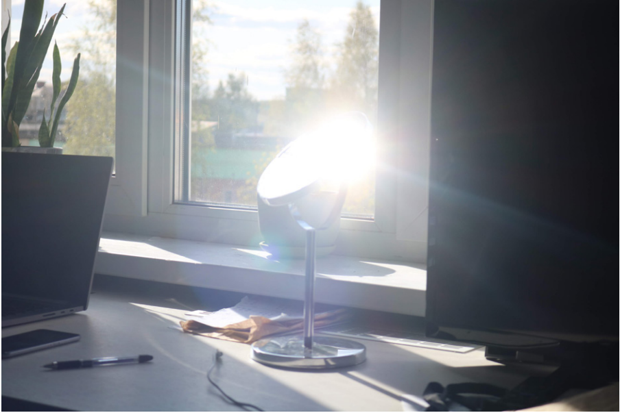
Figure 15. Day seven: Alina's table on a sunny day.

The images that were discussed at the end of the interview significantly differed from those shown at the beginning. The photographed objects on the table (e.g., computer, mirror) remained the same (e.g., Figure 15), but the colours of the photographs became brighter as the contrasts were subdued and the shadows were less prominent. Presented with this much lighter series of images, I concluded that the photographs reflected the family's hope for recovery and return to their pre-COVID routine. The interview discussion, however, revealed that the images were not so much about the uplifting hopeful message as they were meant to convey the acceptance of the situation and the calmness that came with it. Alina's perception of home and her room once again changed. Having perceived her home as a place of confinement at the beginning of quarantine, Alina has gradually accepted it as the new world that replaced everything outside: