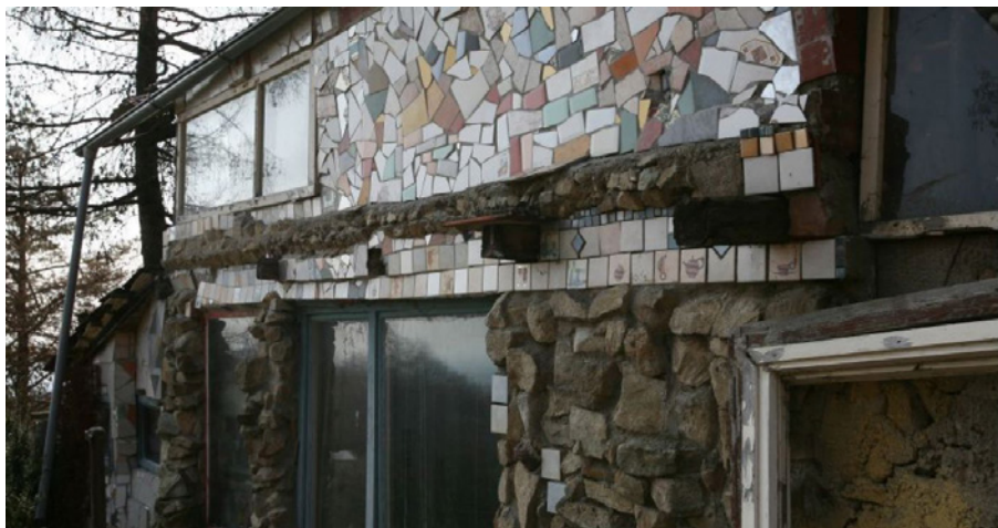
Figure 1. House of Fero Guldán.

to Jewish tomb of Chatam Sofer 1 . He is the author of statues for White Crow Awards (Kováčik 2014) 2 , he exhibits at many places in Slovakia but also in Europe for example in Antwerp as a part of the European Capital of Culture 1993, in Baltimore, Brussels, New York, Paris, Prague and Vienna. He dedicates himself to many activities – “reconstruction, electrical wiring, wooden benches with metal support, sanctuary, fount, murals from different coloured and shaped tiles, and even a monumental picture of Christ (Abraham 2014).