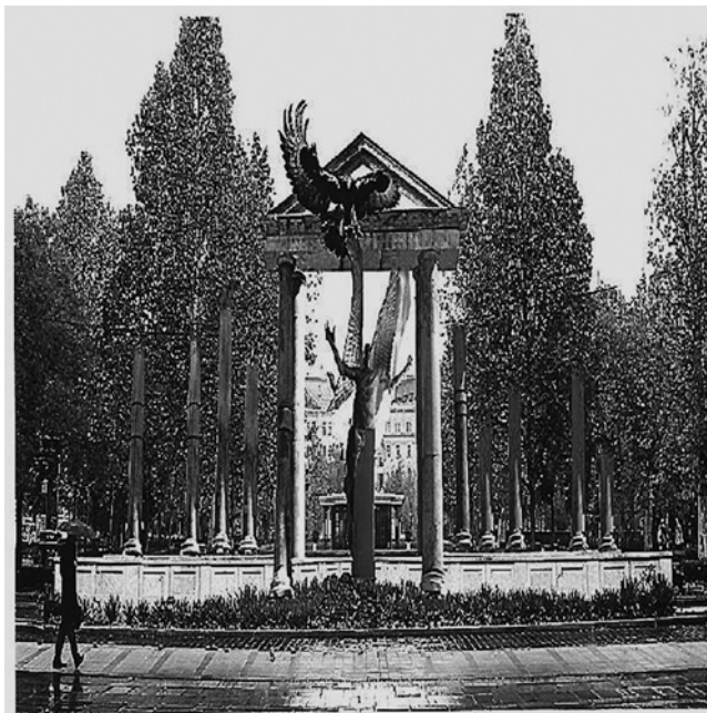
Figure 2. Official design plan of the Memorial to the Victims of German Occupation.