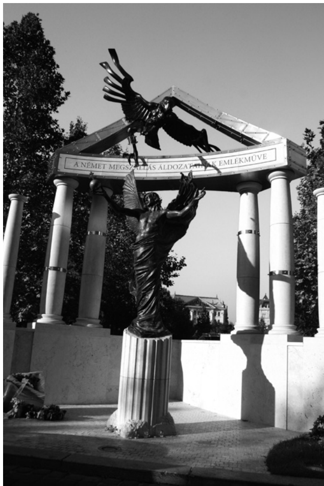
Figure 3. Memorial to the Victims of German Occupation.