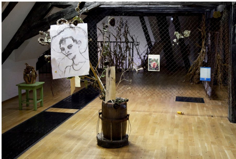
Figure 4. The exhibition "Rural Desires". 2015.

use only black colour, as I used to do in dark studios in the United States or in Bratislava. Never before I would have thought that someday I will paint cherries or apples" (Lacková 2015). In addition to painting, Dúbravský displays very expressive pottery vases, based on the Baroque motifs of chubby cherubs (Hudec 2015). His vases, however, are decorated with his typical rabbit characters.