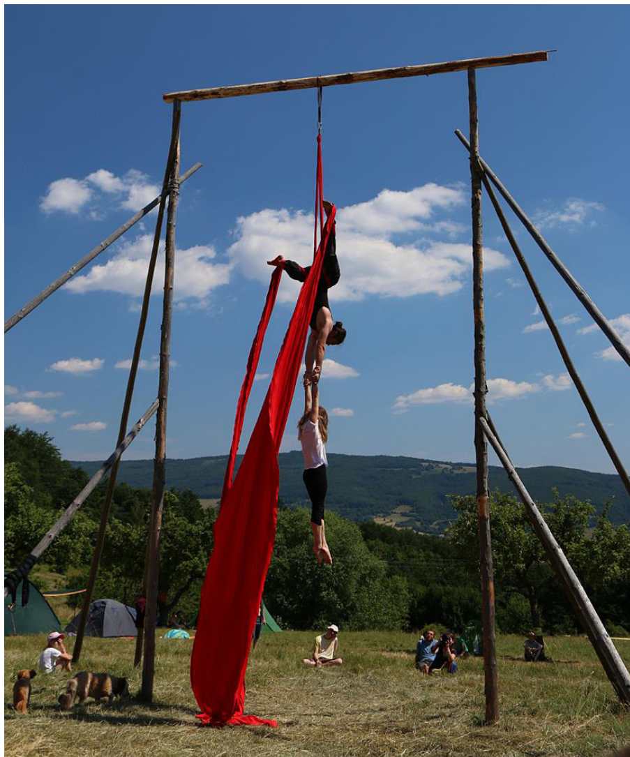
Figure 6. Festival "Celebration on Meadows".