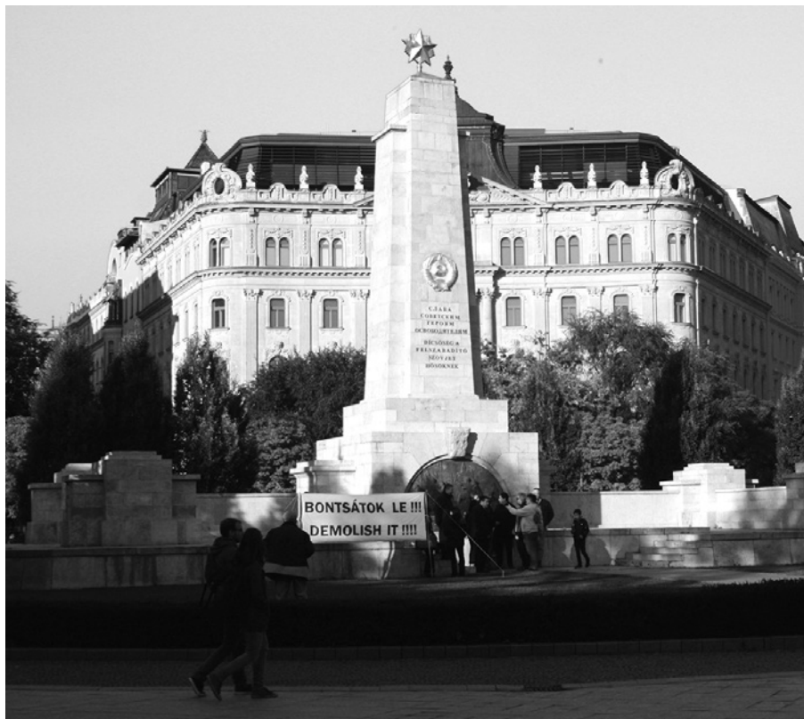
Figure 1. Demonstration at the site of the Soviet Heroic Memorial in 2014.

economic importance”, which not only enabled to evade the authorization of some of the otherwise necessary permits, but also to execute the memorial at an accelerated pace. Even though this high-handed practice unambiguously sheds light on the ever-increasing distance from the original conceptions of an “open” square by Széchenyi, the concept and aesthetics of the German Occupation Memorial itself contained a number of contradictions that ultimately could be used to ridicule this practice of writing history from above.