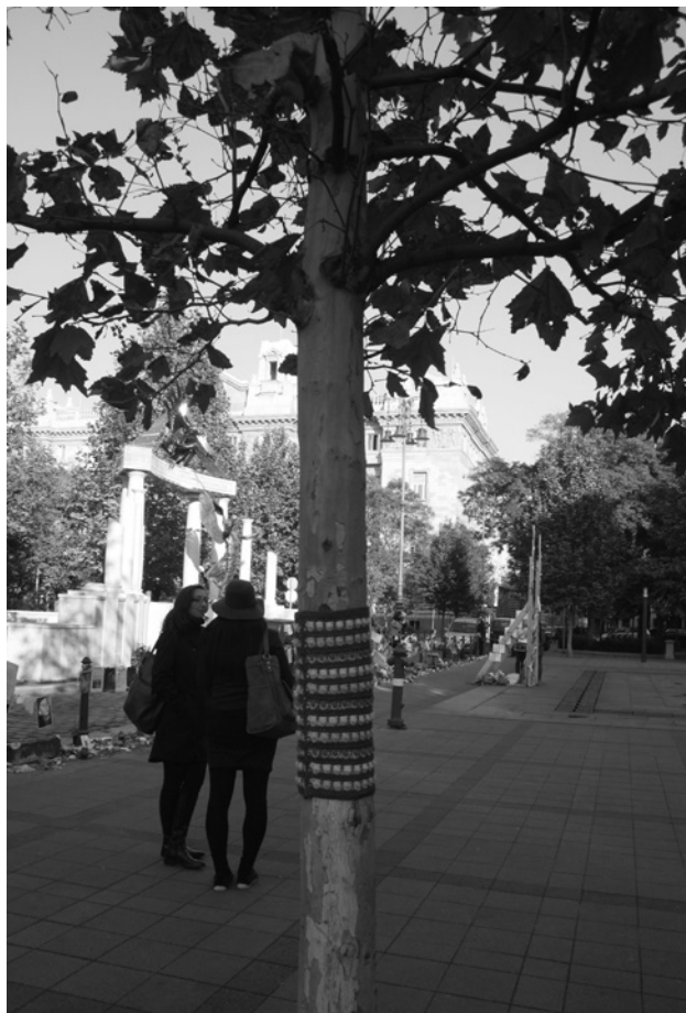
Figure 5. Liberty Square.

memorial itself (in a symbolic, as well as literal sense). We have argued that the Memorial to the Victims of German Occupation is inaccessible in various senses: besides the unfortunate location of the memorial, the process of its realization was closed to any public discussions, and the memorial's ridiculous iconography also made its historical message illegible, ultimately also leaving the question of who is this memorial dedicated to (i.e., who are the victims of German Occupation) open. At the same time, we have also shown that this inaccessibility provoked various responses in the digital realm, transforming the memorial – even if through counter-practices – into a more accessible platform in the urban space, too.