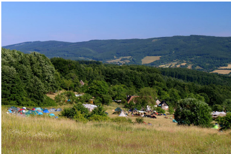
Figure 5. Village of Zaježová.

source of income is not farming, although it is quite evident in the forms of small gardens and orchards where residents grow food for themselves. Besides this, there are programmers, teachers, artisans, environmentalists, people devoted to personal development, education, organize seminars. This way of clustering and individual but interdependent cohabitation/coexisting embodies certain Genius Loci.