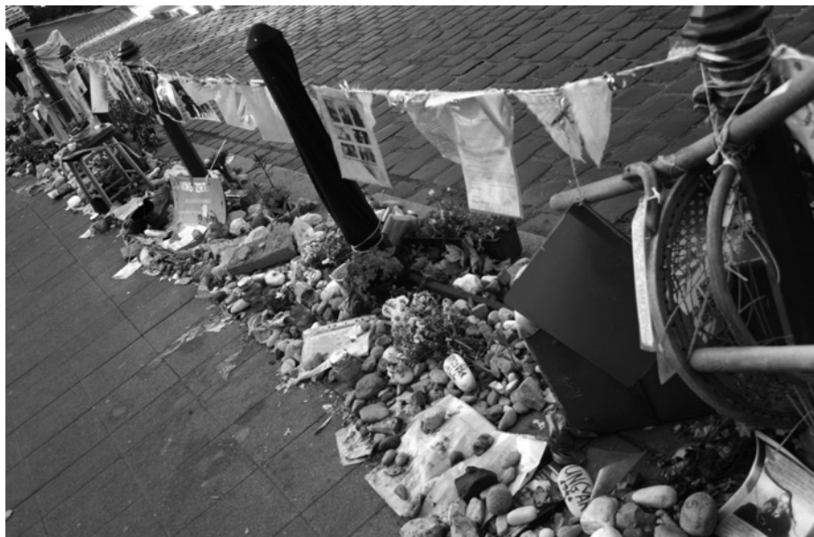
Figure 4. Living Memorial.