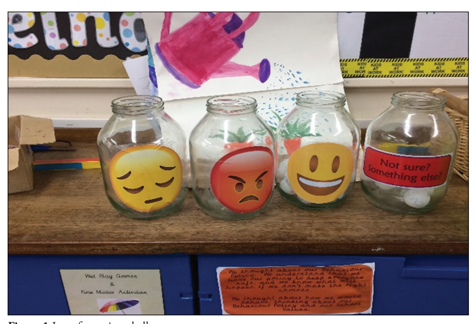
Figure 1 Jars of emoticon balls

As far as the emotional development and wellbeing of the children are concerned, the children engage with these in a very overt manner. On arrival in class every day, each child goes to a big jar full of coloured balls to find their ball with their name on it, which they then put into